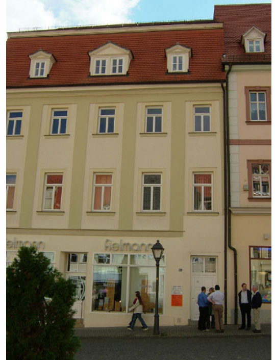
CCG's new office in the historic building faces the statue of the reformer Dr. Martin Luther in the market square. Luther's birthplace, a memorial since 1693, is the oldest museum in the German-speaking area.

He says, "It is nice that Contemporary Controls can share a part of history. The history that is so important to the people of Eisleben and to Germany."