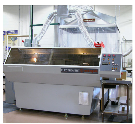
Another important step of the process for RoHS compliance was converting the company's solder wave machine by refitting pumps and changing solder pots to titanium.

There were other changes on the production floor as well. Maloney said lead-free solder has a different odor than our leaded alternative. "Personnel had to enclose the area behind our solder pots with a curtain and an exhaust system so the