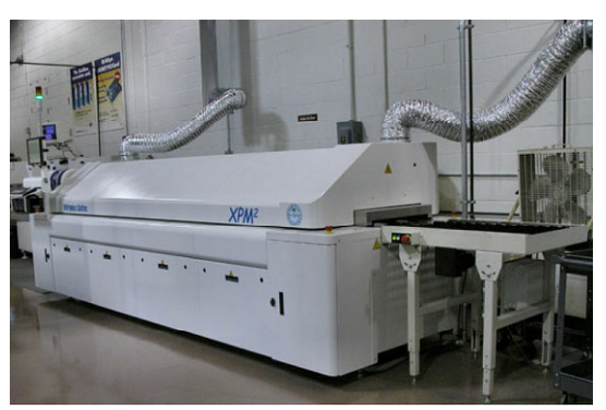
required 217°C temperature and to acquire the proper ramp rate A new Vitronics® XPM820 reflow oven was purchased in order to solder at the required temperatures, necessary to meet RoHS compliance.

Maloney said the process involved the purchase of new capital equipment, specifically a new Vitronics® XPM820 reflow oven occupying 15 lineal ft. of processing space. The oven takes solder paste and reflows it so the solder can adhere to the metal portions of the components. The oven is designed with eight heating zones and two cooling zones in order to attain the required 217°C temperature and to acquire the proper ramp rate